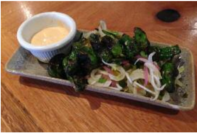
Grilled pardon peppers